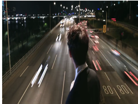
Figure 3 The music video of "Zombie"