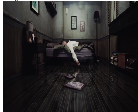
Figure 4 The music video of "Zombie"

"Wishing to stop and close my eyes" has the strong connection with the pictures above. On the first image, the model was looking out at the road below from the bridge after go back from the office. He thought to suicide by jumping to the road. However it never happened because he still go home and lying on his bed. His thought to end his life will be replaced by just closing his eyes and do the same activity for tomorrow. It shows the will to end everything but he could not do that because of the certain reason appears on those scenes.