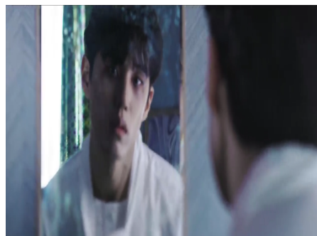
Figure 5 The music video of "Zombie"

"Wishing to stop and close my eyes" has the strong connection with the pictures above. On the first image, the model was looking out at the road below from the bridge after go back from the office. He thought to suicide by jumping to the road. However it never happened because he still go home and lying on his bed. His thought to end his life will be replaced by just closing his eyes and do the same activity for tomorrow. It shows the will to end everything but he could not do that because of the certain reason appears on those scenes.